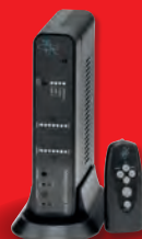
Room Loop Systems