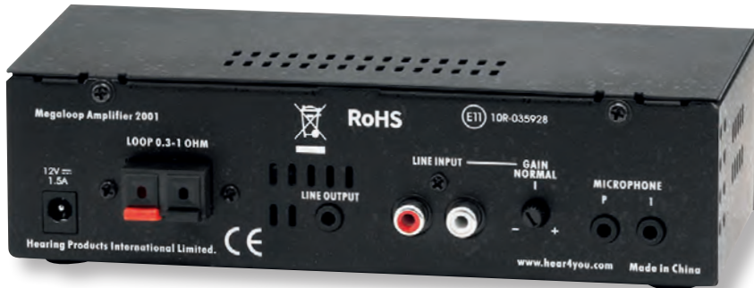
Echo® MegaLoop™ back of unit

There are also two specifically designed microphone sockets, one to be used when the microphone is fixed to a TV speaker and one as a priority for environmental sounds or for conversation.