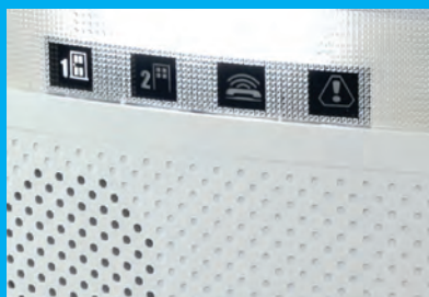
EchoChime300™ Front Panel