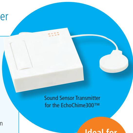
Sound Sensor Transmitter for the EchoChime300™