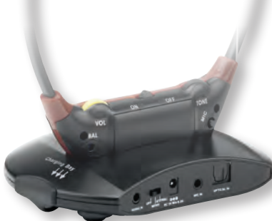
Echo® 2.4G Rear Panel

Connections include digital (Optical/Toslink), analogue audio or microphone. The transmission distance is up to 30m, which gives you uninterrupted sound throughout most of your home.