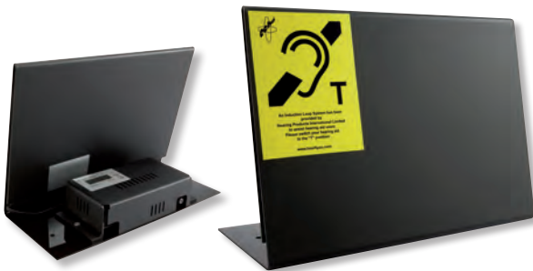
Echo ® DeskLoop ™ viewed from the back