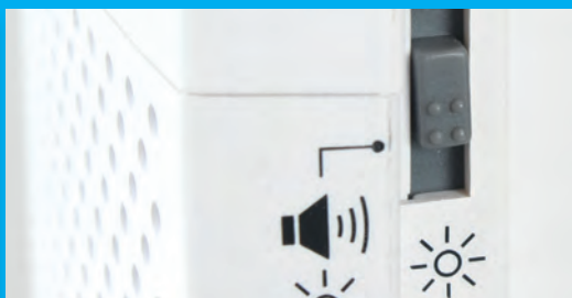
EchoChime300™ Side Panel

EchoChime300™ has a 4 to 1 capability; up to 4 transmitters can signal to one receiver, choose from door bell, intercom, magnetic sensor for door/window alarm, chair/ bed sensor alarm or PIR (Passive Infrared Sensor).