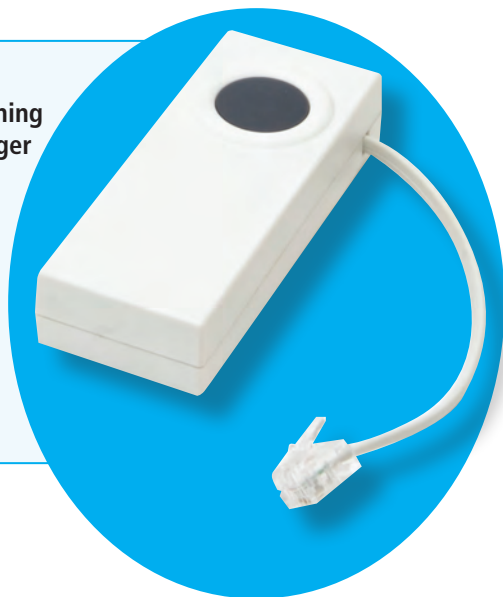
Telephone Signaller Transmitter for the EchoChime300™

The telephone signaller is simply plugged into the telephone socket using the doubler provided. It will then activate the flashing chime or vibrator each time an incoming call is detected.