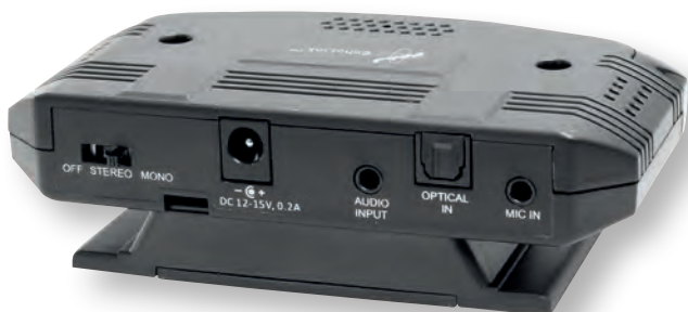
EchoLink™ transmitter back

There are no batteries to change as the receiver has a built in intelligent charging circuit, this produces a fast charge for the receiver, which when fully charged can provide up to 30 hours listening time. The receiver only charges until the battery is at full capacity.